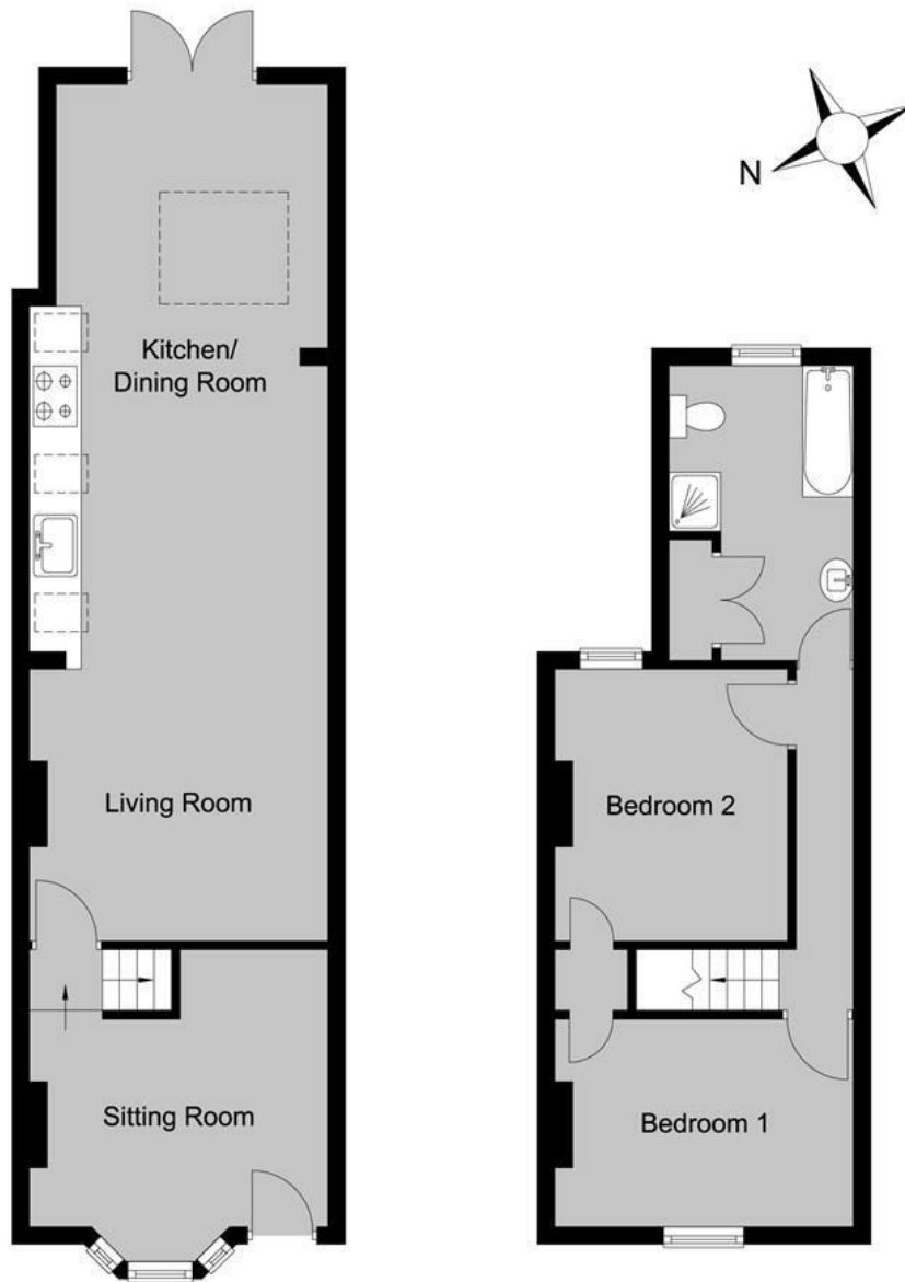
First Floor Approx. 29.7 sq. metres (319.7 sq. feet)

Total area: Approx. 81.0 sq. metres (871.9 sq. feet)